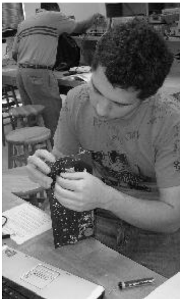
Building AM/FM Radio in Intermediate Circuits