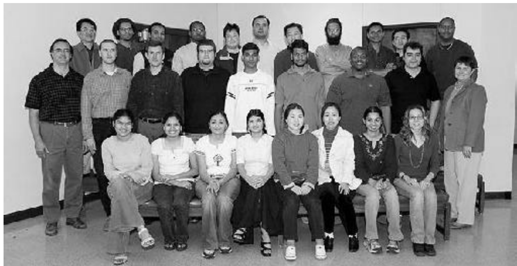
E-Ship Faculty and Students

With the help of the ESRDC and ECE faculty and students, the United States will be in a better position to avoid having a ship that is “dead in the water.”